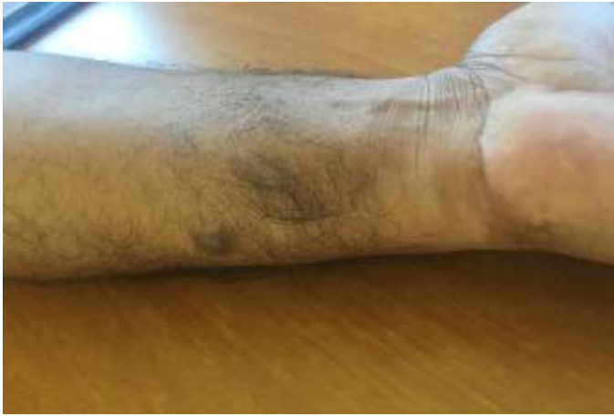
Figure1 : Photograph of a painful nodular subcutaneous lesion with pigmentation of the surface skin of the forearm.