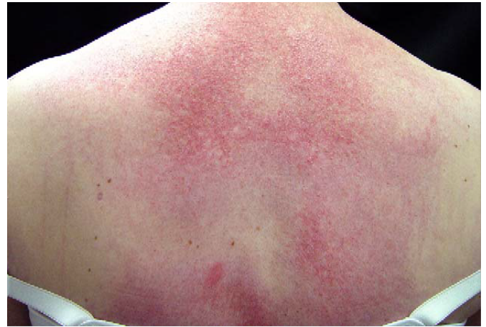
FIGURE 1: Poikiloderma on the upper aspect of back is typical of the shawl sign.

Baseline haematological and biochemical investigations revealed normal complete blood count, Hb%-12.4 gm/dl, WBC-7600/cc, Neutrophil-50%, Lymphocyte-42%, Eosinophil-4%, total platelet count 393000/cc. Inflammatory markers were elevated with ESR-42mm in 1st hour and CRP 45. LDH, AST, levels were elevated at 2290U/L and 243U/L respectively. Her CPK level was significantly raised with 13738/L (Normal: 30-135U/L). ANA, Anti ds DNA, Rheumatoid factor, ENA profile, HBsAg were negative. EMG findings